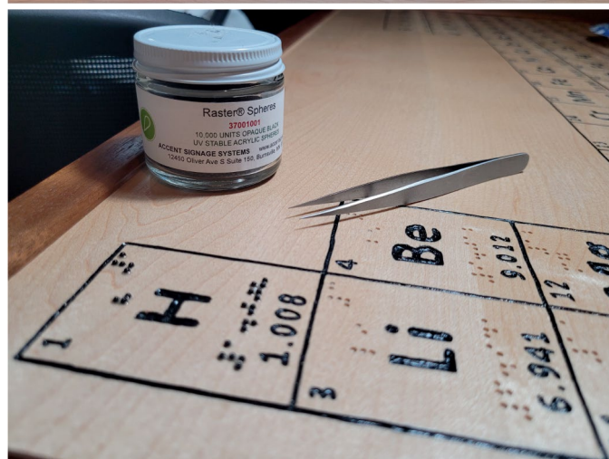
Fig. 1 The tactile periodic table. The tactile periodic table prototype took 200 hours to make by hand including 15 minutes to add the Braille for each element using the tools shown.

The hand-carved prototype is preparing for a final trip where it will be hung permanently in the Bioengineering Laboratory at Northeastern University. Michael is adding the Braille to the machined-carved prototype and plans on using the Kent Roosevelt CAD design to start a third prototype at the think[box]. We are happy to chat with anyone interested in making their own.